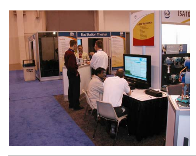
Exhibit Live Demonstration

Visitors to the booth had an opportunity to see what EDDL-based device management software is capable of and get a notion of how their work can be simplified and be made more effective.